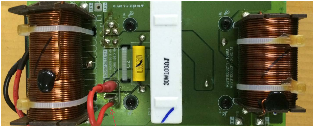
The jumper is shown in the image above

Please see the picture below. This illustrates the side of the printed circuit board that is seen when the high frequency horn is removed. This is seen by looking thru the hole in the 108/HTH enclosure where the horn was mounted. The jumper is shown in the picture below.