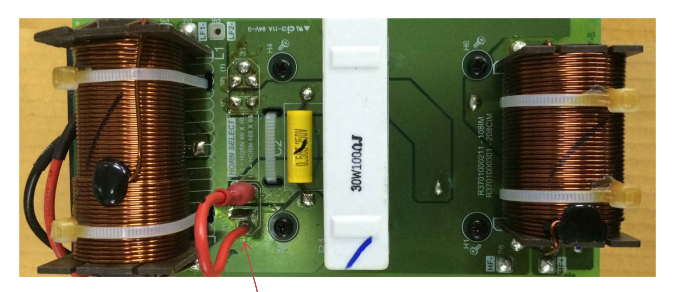
The jumper is shown in the image above

Please see the picture below. This illustrates the side of the printed circuit board that is seen when the high frequency horn is removed. This is seen by looking thru the hole in the 112/HTH enclosure where the horn was mounted. The jumper is shown in the picture below.